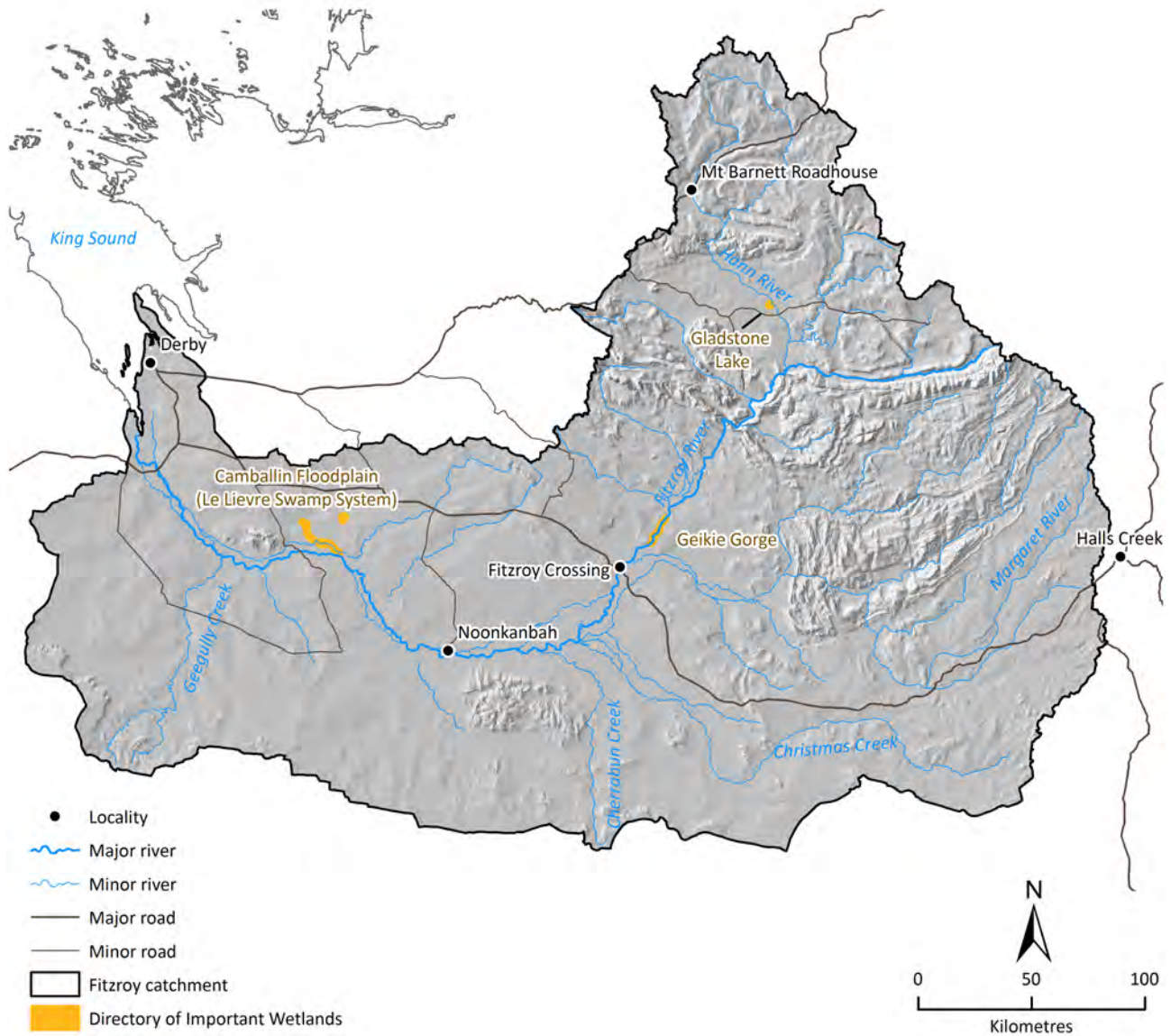
Figure 1-3 The Fitzroy catchment A more detailed map of the Fitzroy catchment can be found on the inside back page of this report.

clay soils of the Fitzroy River alluvial plain and limestone geologies. Large areas of steep or shallow and/or rocky soils in the east and north of the catchment are unsuitable for irrigation development.